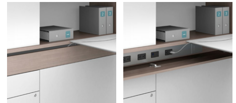
Flip Door offers quick access to power & data.

Please refer to the Community Pricebook for all options.