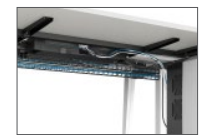
Access Box Power detail