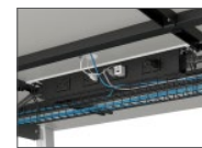
Grommet Power detail