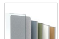
Glass, PET, Fabric, and Laminate available.

Please request samples to view before specifying as the colors, materials and finishes featured within our printed and electronic literature may vary due to the printing processes and/or viewing screens used. Availability of finishes and materials shown within this brochure may vary due to manufacturers' lifecycle management.