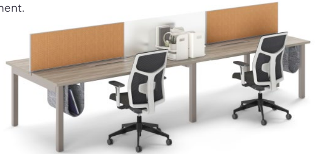
Oxygen allows for easy touchdown stations to support a variety of workstyles.