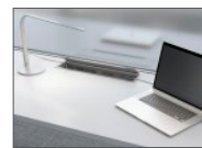
Flip Top Worksurface Access Box.